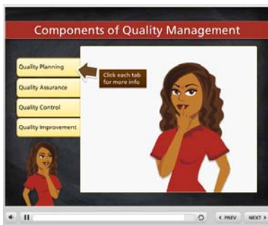
Animated & Interactive

This online course uses animated and interactive content to provide an introduction to the world of ISO 9001:2008. Through this independent, on-demand training, participants will gain an understanding of the history, principles and fundamentals of Quality Management, Quality Management Systems, and the ISO 9001:2008 standard itself.